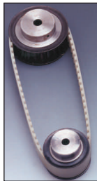
SINGLE SIDED BELT

STD : Polyurethane Belt Body with Steel Tension Members